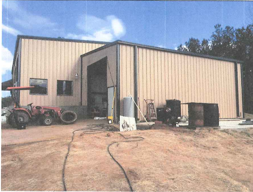
Right Side View (02/23/16)

If submitting more photographs than will fit on the preceding page, affix the additional photographs below. Identify all photographs with: date taken; "Front View" and "Rear View"; and, if required, "Right Side View" and "Left Side View." When applicable, photographs must show the foundation with representative examples of the flood openings or vents, as indicated in Section A8.