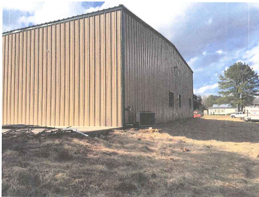
Left Side View (02/23/16)