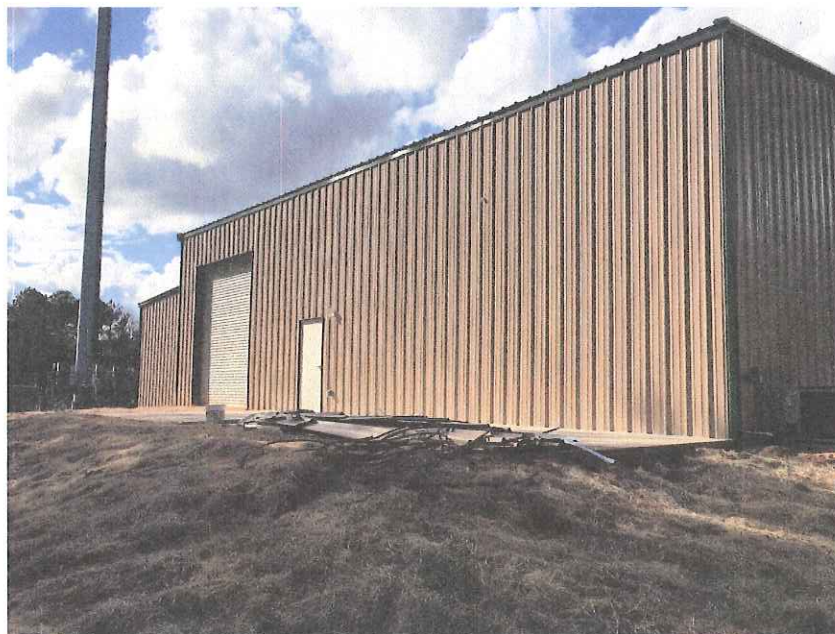
Rear View (02/23/16)