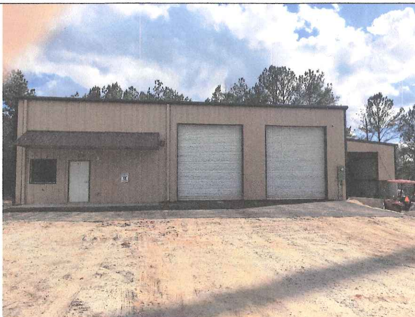
Front View (02/23/16)

If using the Elevation Certificate to obtain NFIP flood insurance, affix at least 2 building photographs below according to the instructions for Item A6. Identify all photographs with date taken; "Front View" and "Rear View"; and, if required, "Right Side View" and "Left Side View." When applicable, photographs must show the foundation with representative examples of the flood openings or vents, as indicated in Section A8. If submitting more photographs than will fit on this page, use the Continuation Page.